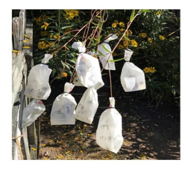
Figure 4. Pollination bags covering multiple heads of Helianthus verticillatus. Seeds were harvested in November 2017.