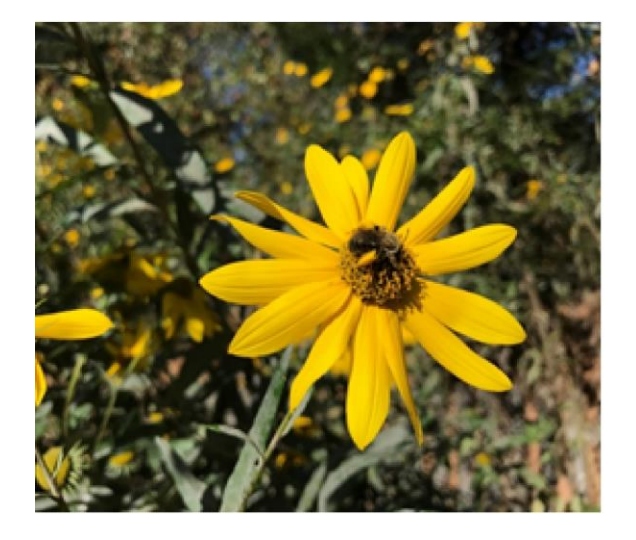
Figure 3. In the center of the flower is a native bee (Bombus sp.), a potential pollinator of Helianthus verticillatus.