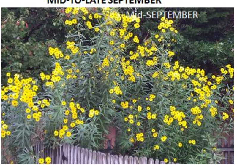
Figure 2. Rapid vegetative growth (early August) and prolific flowering on tall stalks of Helianthus verticillatus in September.