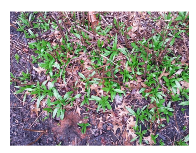
Figure 1. Helianthus verticillatus emerging in the spring.

Plants emerge in late winter in Tennessee as a basal rosette (Figure 1) and reach 3-4 meters by August (Figure 2). It flowers profusely in August and September, and through the middle of October or until a killing frost. The plants bear up 20, 4-6 cm diameter yellow ray flowers with brown to black discs at the 20-30 cm of the termini of