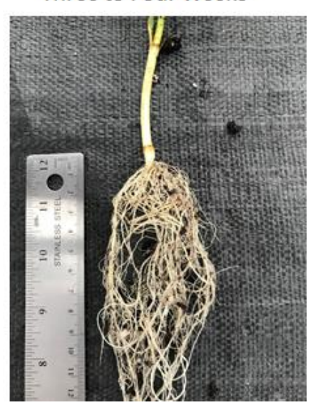
Figure 8. Clonal propagation by cuttings of Helianthus verticillatus .